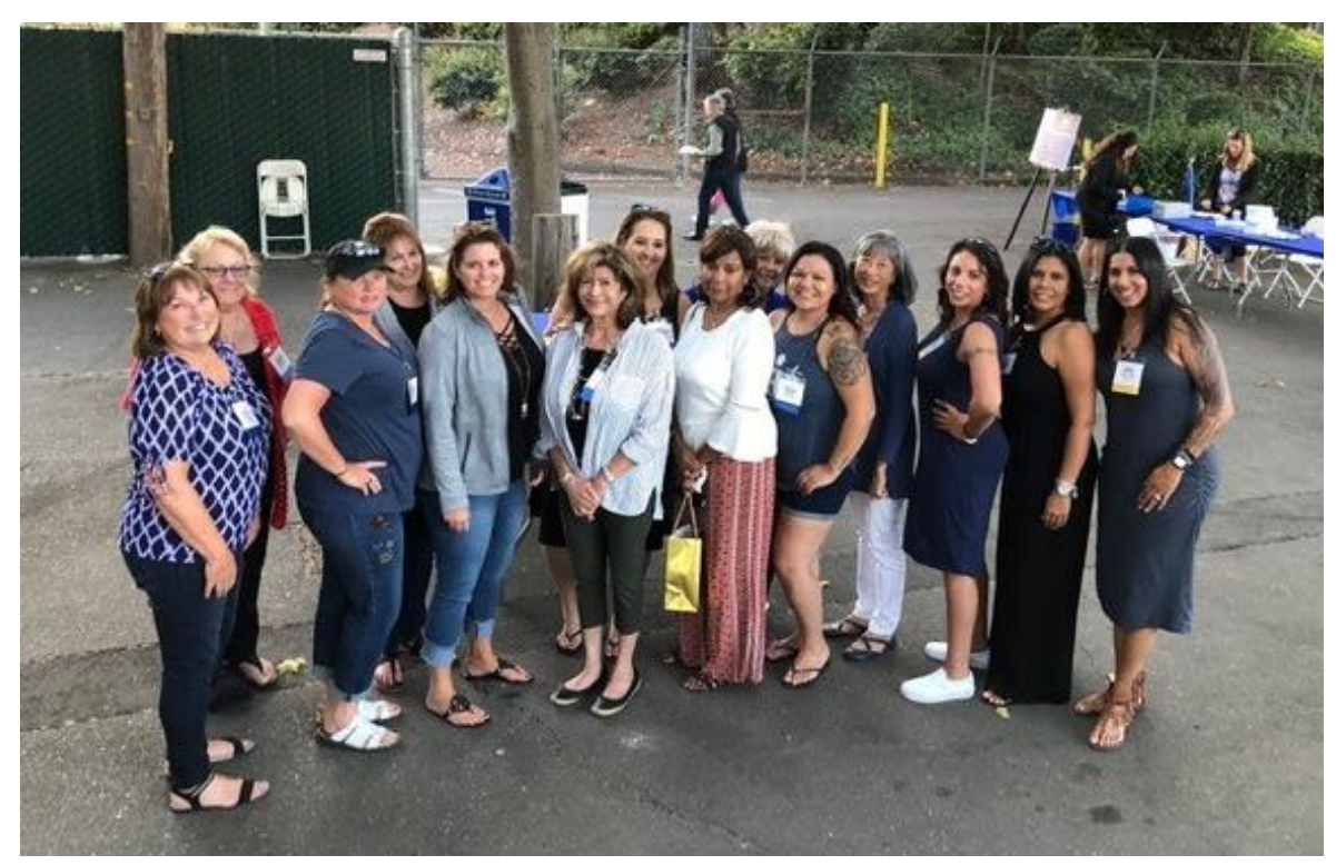
Family Members at the 100 Club BBQ August 2019